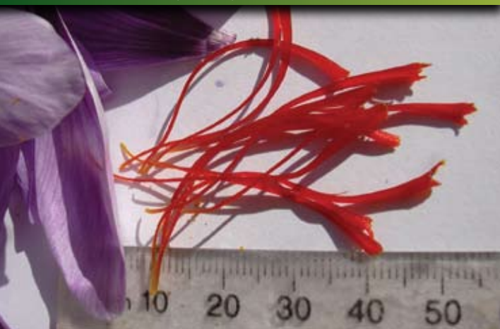
A harvest of fresh saffron strands, cut from the open blooms, ready for drying and storage.

A hydroponic saffron bed can be left in place for many years if necessary. The new cormlets don't need to be harvested each season and can be left in place to flower and grow. Overcrowding will occur sooner or later and it's often easier to harvest all the corms, re-plant and re-space each year.