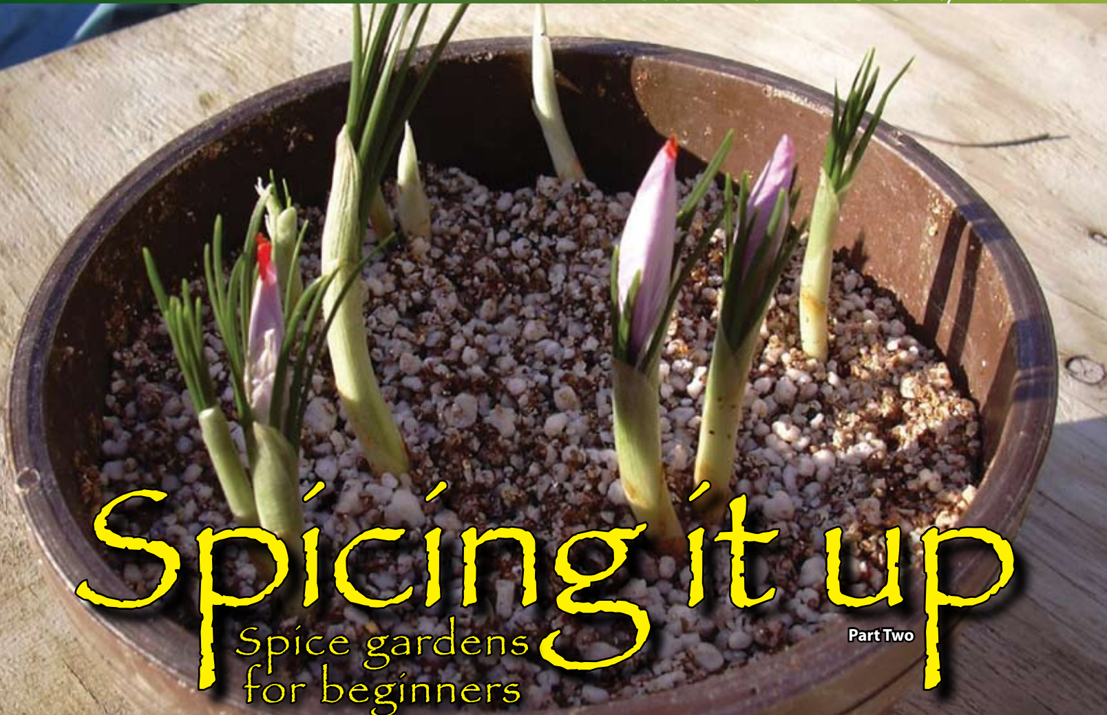
Saffron can be grown in beds, containers or small pots, making it a great crop for small spaces.

In the first article in this series on spice gardens for beginners, we covered some system basics and detailed how to grow members of the ginger family. While many hydroponic gardeners love the pungent, spicy zing of ginger, some of the more subtle spices are just as tempting. Saffron is a sought-after, expensive, delicate spice which adds both color and distinctive flavor to many dishes.