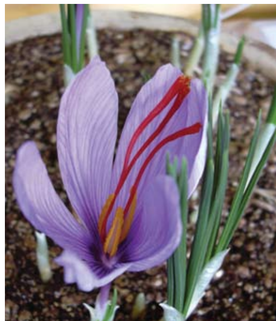
A free draining sterile media, some warmth and moisture will give not only colorful blooms but exotic spice as well.

In their natural environment, the saffron plants' foliage dies back in mid to late summer, after the young corms have matured and as conditions become very warm and dry. The corms then go into a dormancy period which is essential for