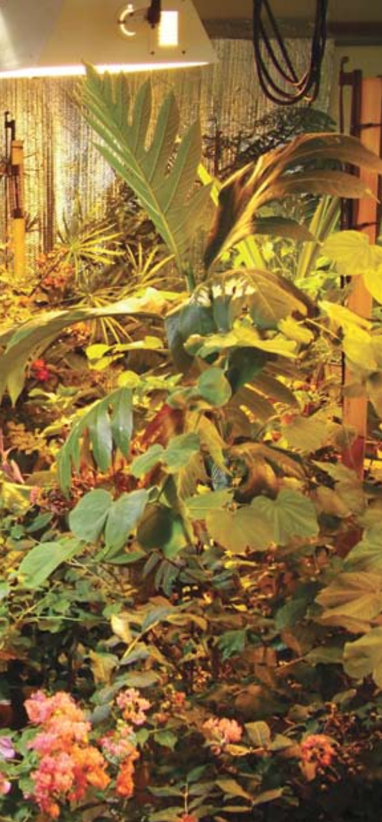
Left: Metal halide lights produce light similar to the sun's rays in spring and summer, beneficial for vegetative growth. High-pressure sodium lights simulate the sun's light in fall, encouraging plants to fruit and flower indoors. Below: For best results, plumeria seedlings should not go dormant the first year. This group of young plants spent their first winter under the bright HID lights of the converted garage/greenhouse. Top right: A shrimp plant, unaware of the below-freezing temperatures outside, blooms radiantly all winter in the converted garage/greenhouse. Bottom right: Angraecum distichum displays tiny white flowers under the HID lights.